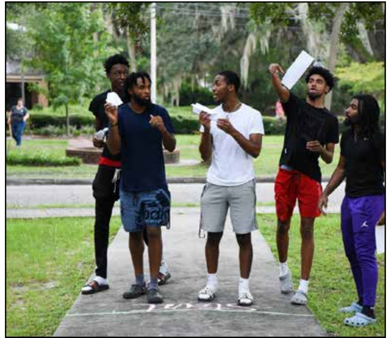
As part of their “Amazing History Race,” student-athletes at USC Salkehatchie participated in activities that taught them aspects of Carolina Lowcountry history. In one of four challenges, students (above) designed and flew paper airplanes inspired by the World War II-era Tuskegee Airmen who completed part of their training at a Walterboro, S.C., airfield.

The winners of the Amazing History Race were: