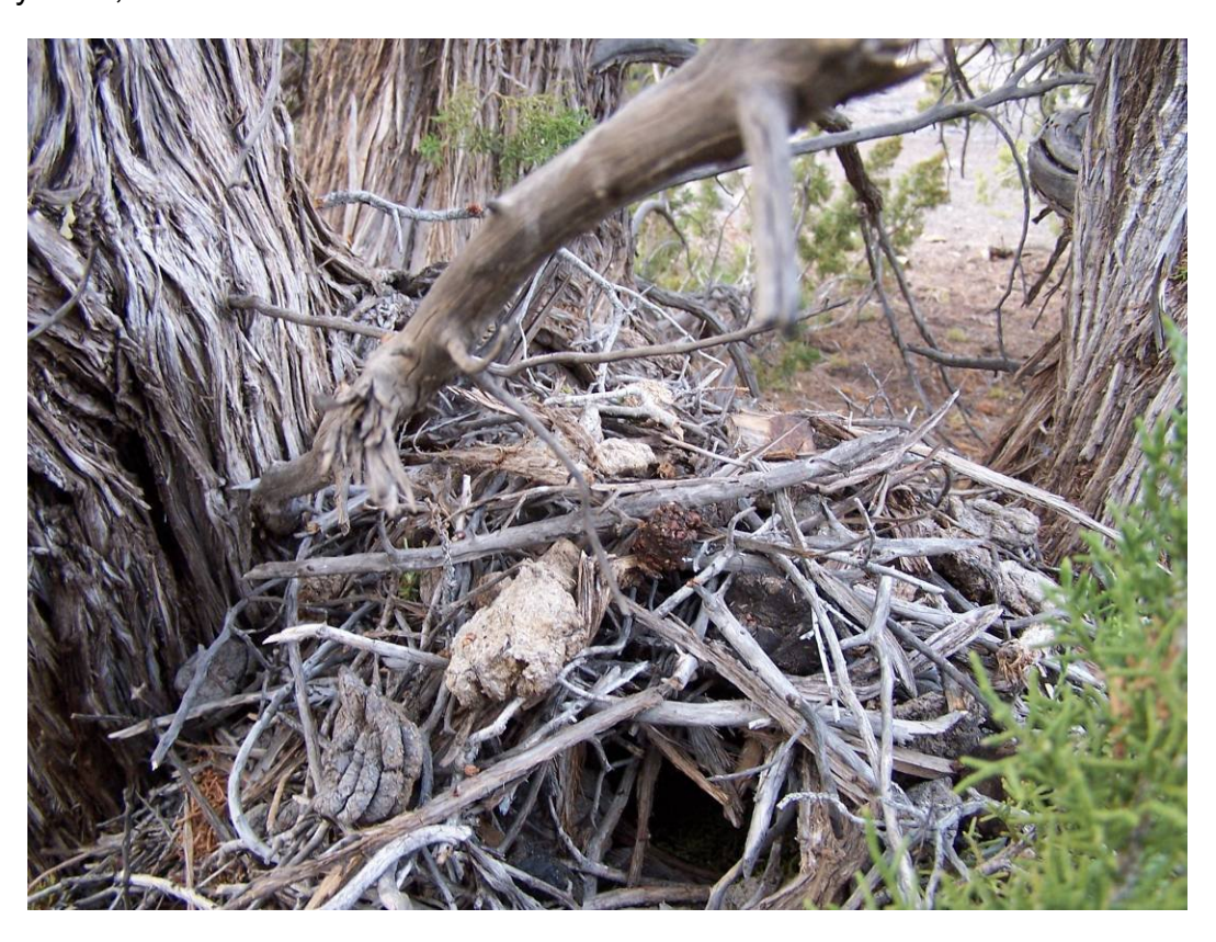
Figure 1.—Photograph of a woodrat midden. Photo was taken at one of our 9 study sites, located in the Great Basin Desert of central Utah.

The objective of our study was to examine whether woodrat middens serve as sites of inter-specific transmission of SNV. Our primary questions were: 1) are population density and species diversity higher in woodrat middens compared to non-midden habitats and 2) is SNV prevalence higher among SNV host populations that reside in woodrat middens, compared to SNV hosts that reside outside of middens. We predicted that woodrat middens would have both higher population density and species diversity compared to comparable non-midden habitats. Because woodrat middens provide high-density habitat with frequent SNV transmission opportunities, we also predicted that prevalence in all potential SNV host species would be higher among populations captured within middens than in populations captured outside of middens.