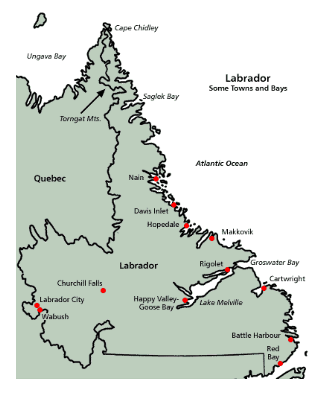
Figure 1.—Map of the Labrador region (Map by Duleepa Wijayawardhana. ©1999 Newfoundland and Labrador Heritage Web Site Project).